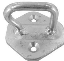
070-1000 8mm Hoop Strike