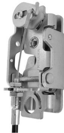
Cable Mount Bracket With Barrel Actuation and Cam