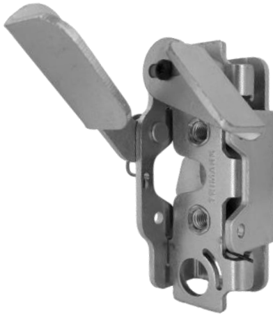
Barrel Actuation With Direct Release Cam and Top Direct Release Actuator

Individual part dimensions are for reference only. Refer to individual part drawings for complete dimensions, specifications, and installation procedures. Engineering assistance and application drawings are available.